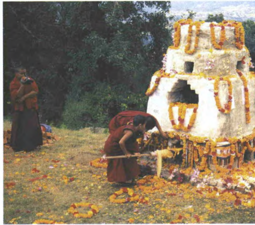
The cremation - Monday October 22, 2001